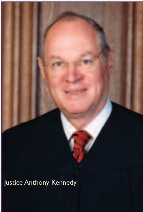
Justice Anthony Kennedy