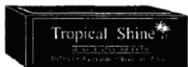
Falley Buffer Block